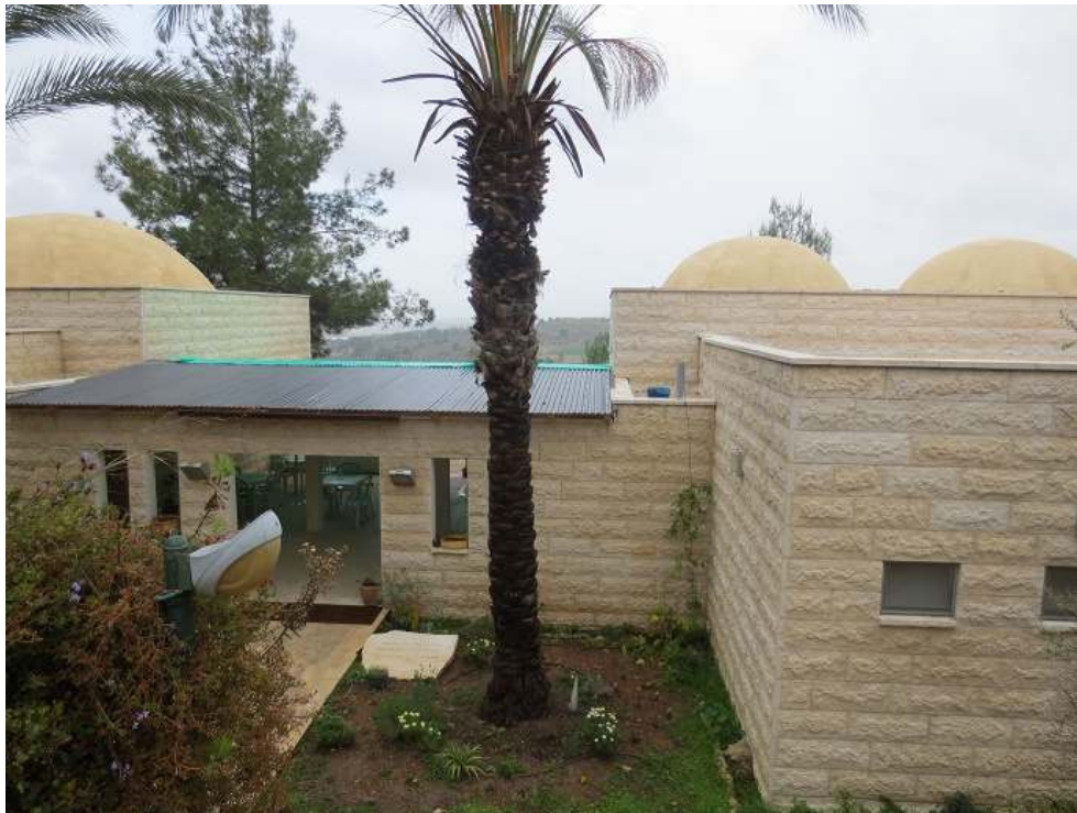
Figure 3: The Spiritual Center