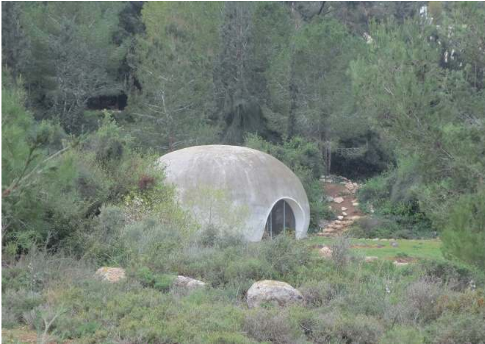
Figure 2: The House of Silence

orientation point to get to know the field and all interviewees referred to it while describing their meaning of spirituality.